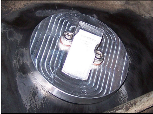
Typical Super Duty Adapter – Angled Forward