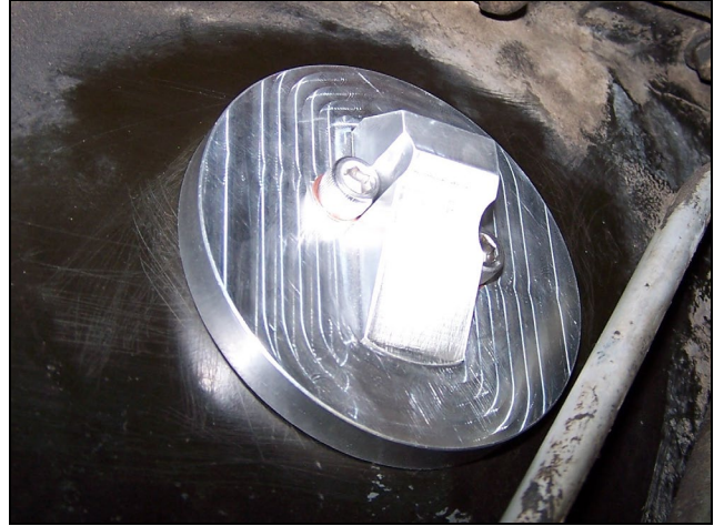
Typical OBS Adapter – Straight Up